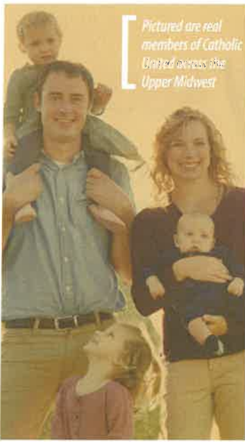
Pictured are real members of Catholic United across the Upper Midwest